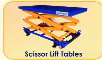
Scissor Lift Tables