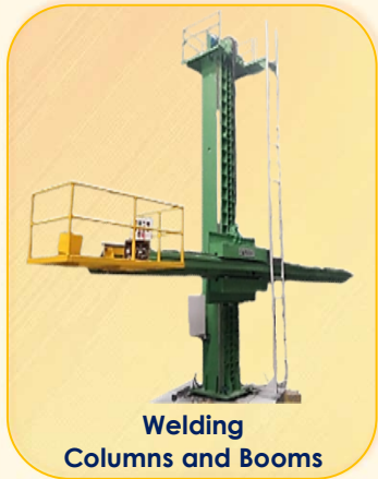
Welding Columns and Booms