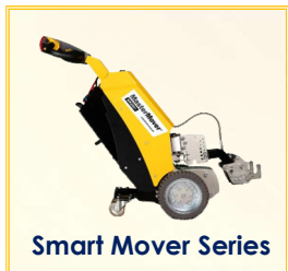
Smart Mover Series