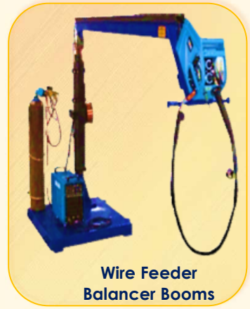
Wire Feeder Balancer Booms