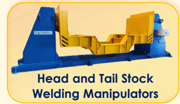
Head and Tail Stock Welding Manipulators