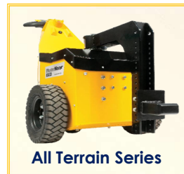
All Terrain Series