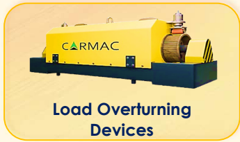
Load Overturning Devices