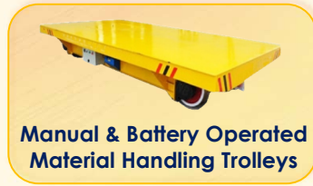
Manual & Battery Operated Material Handling Trolleys