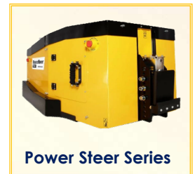
Power Steer Series

FOR MORE DETAILS, VISIT THE WEBSITE : https://www.mastermover.com/en-in