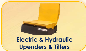
Electric & Hydraulic Upenders & Tilters