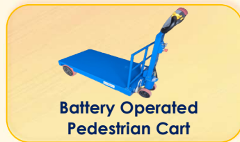
Battery Operated Pedestrian Cart