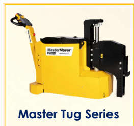
Master Tug Series